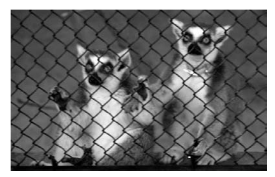
Two Ring-Tailed Lemurs, holding hands. Sorry about the blur, they would not sit still no matter how much I begged.

Judging by the almost non-stop smiles of the 33 New Hope Audubon members and their guests who visited the Duke Lemur Center on March 28, the center is fulfilling its mission to "promote human happiness."