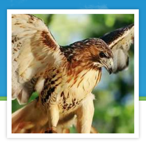
North Carolina Botanical Garden - Garden of Wonder Bird Blind

P.O.Box 2693, Chapel Hill, NC 27515 http://www.newhopeaudubon.org